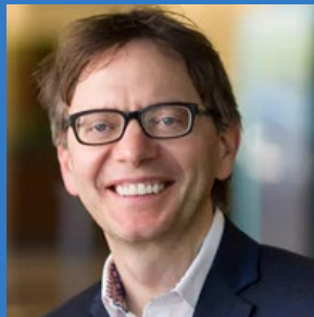
David Dodick USA